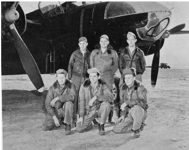
162 nd TRS aircrew and ground crew.

Evasive action and speed proved ample defense against the occasional ground fire encounters a circumstance for which the crews of our unarmed aircraft were grateful.