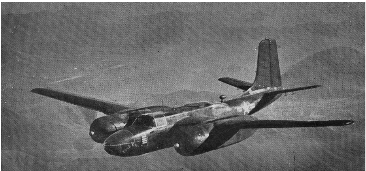
162 TRS RB-26C